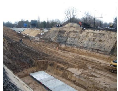
Site after abrasion through the FRUTIGER Scrapedozers.