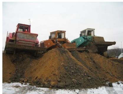
Deposition of the material on the 200 m away landfill.